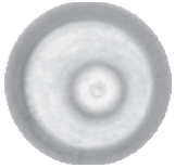
Well without disk