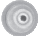
Well with disk