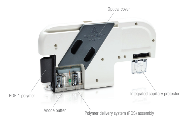
Figure 2. Integrated all-in-one cartridge design. The cartridge contains four capillaries, a detector, and a pump system that delivers polymer and buffers.