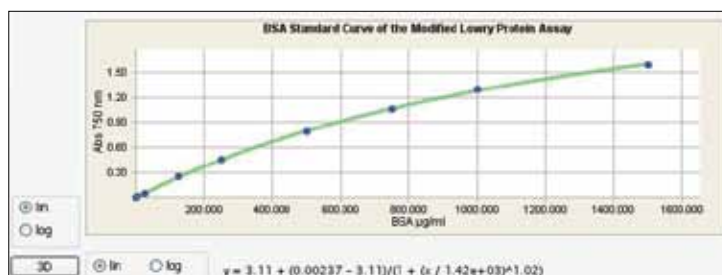
Figure 3. The BSA standard curve of the Modified Lowry Protein Assay generated with the Quantitative Curve Fit calculation step of the SkanIt Software. The four-parameter logistic was used as the curve fitting type.