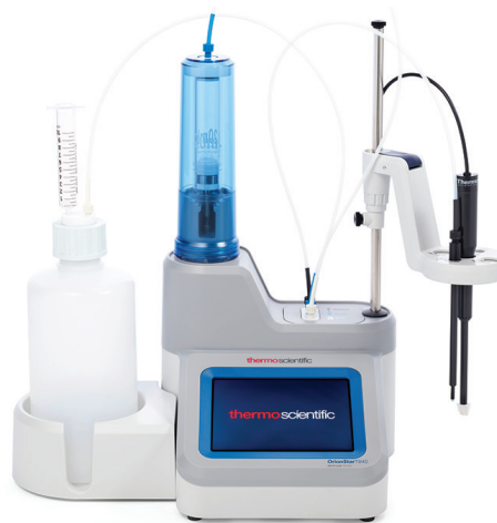
Orion Star T930 ISE Titrator with 20 mL burette