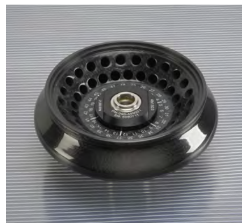
Thermo Scientific Fiberlite F21-48x2 Rotor