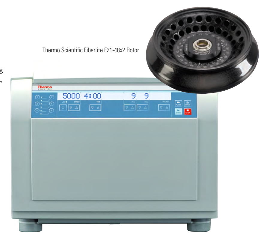
Thermo Scientific 1-Liter General Purpose Benchtop Centrifuge

The following describes a procedure for isolation of plasmid DNA using the new general purpose benchtop centrifuge with the Fiberlite® F21-48x2 rotor. By increasing the capacity of the standard microcentrifuge, more DNA preparations can be processed at one time, allowing more downstream experiments quicker. This is a great solution for research labs, clinical labs, forensics labs and any facility performing microvolume separations.