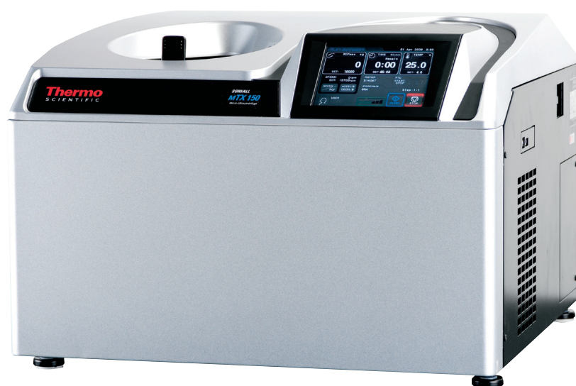
Sorvall MTX Micro-Ultracentrifuge

The 2 mL concentrated phage suspension was overlaid onto a three-step CsCl gradient containing 1 mL of 1.7 g/mL CsCl, 1 mL of 1.5 g/mL CsCl, and 1 mL of 1.4 g/mL CsCl in a 5.1 mL polyallomer Re-Seal™ ultracentrifuge tube (PN 45248). Phage were centrifuged for 7 hours at 603,000 x g using the Thermo Scientific S100-AT6 rotor in a Sorvall® MTX Micro-Ultracentrifuge; the Sorvall MX Micro-Ultracentrifuge can alternatively be used. The white-to-grey phage-containing bands were extracted through the wall of the centrifuge tube by puncturing with a needle, and the CsCl was subsequently removed by dialysis using a 6,000–8,000 dalton membrane for 15 hours with three changes of deionized water. The concentrated phage were negatively stained with 2% uranyl acetate (pH 4.0) and electron microscopy carried out using an electron microscope at 80 KV.