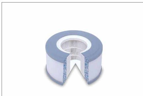
Fig. 02 | HEPA air-filter (VOC)