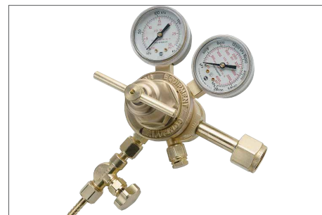
Fig. 03 | Two-stage CO 2 gas regulator