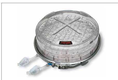
Fig. 05 | Sealed modular incubator chamber