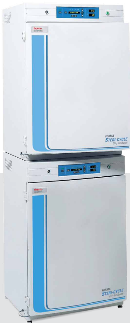
Forma Steri-Cycle Incubators are readily stackable to preserve floor space (hardware included).

Thermo Scientific™ Forma™ Steri-Cycle CO 2 Incubators offer ISO Class 5 HEPA filtration and 140° C on-demand high temperature sterilization.