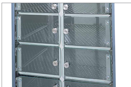
Fig. 01 | Inner glass door kit