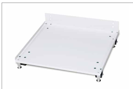
Fig. 04 | Roller base and stand