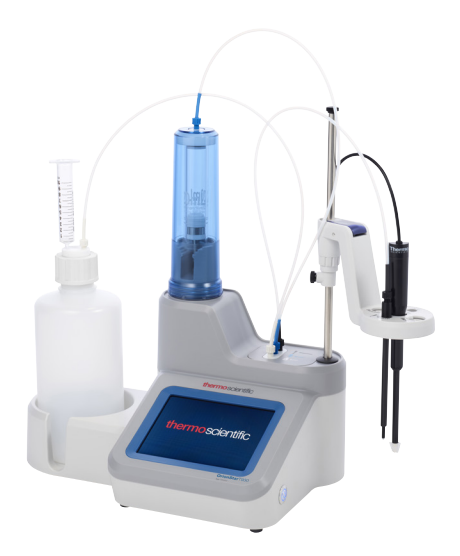
The Thermo Scientific Orion Star Ion Titrator.

If bubbles are visible in the tubing, dispense titrant (from the Burette screen) until the bubbles have been expelled. Tap the tubing to dislodge bubbles. Consider standardizing the titrant before titrating samples. See Titrant section later in this document for details.