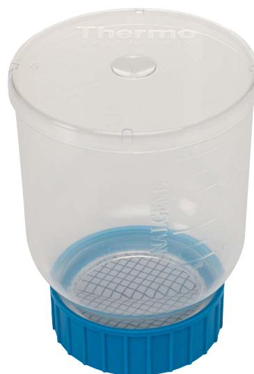
Thermo Scientific™ Nalgene™ Analytical Filter Funnel

Filtration is a common practice in water quality and/or food and beverage testing. The critical considerations when establishing a filtration protocol are flow rate of the liquid tested and microbial recovery rate.