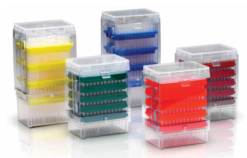
Figure 2. Color-coded inserts for easy tip volume identification.

The hydrophobic surface of SoftFit-L low-retention tips minimizes the amount of liquid remaining in the tip following dispensation, helping increase accuracy and reproducibility. Low-retention tips are ideal for use with viscous reagents, nucleic acid and protein assays, or expensive reagents.