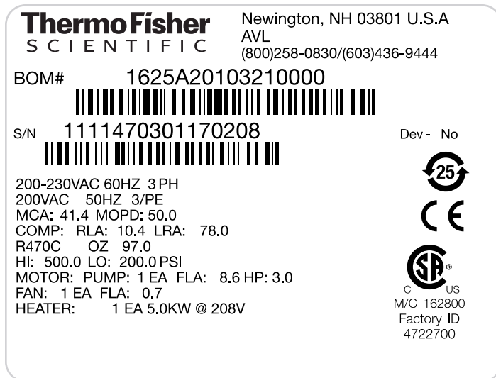
Figure 1: Three Phase serial tag.

NOTE: Because the data above is only going to be used to size a HVAC system, we are going to ignore the "Power Factor" 1 of some components that result in a slightly lower use of electrical energy than the calculations shown here.