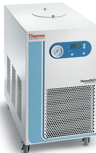
Thermo Scientific™ ThermoChill I recirculating chiller

Keywords: HVAC requirements, room heat, chiller heat, water-cooled chiller, air-cooled chiller, room temperature, recirculating chiller