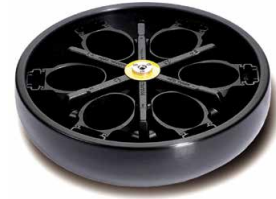
Thermo Scientific™ HAEMAFlex™ 6 windshielded swinging-bucket rotors, 6 x 550 mL