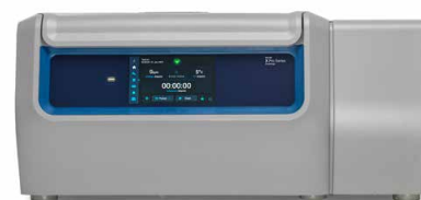
Thermo Scientific™ Sorvall™ X4R Pro/Multifuge X4R Pro General Purpose Centrifuge