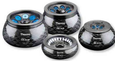
Fiberlite carbon fiber rotors

The Fiberlite carbon fiber rotors used in our centrifuge models improve energy efficiency compared to aluminum and other metal rotors. Fiberlite rotors weigh up to 60% less than aluminum rotors (Table 5). Less weight allows for faster acceleration and deceleration rates for shorter run times (Table 6). The decrease in time of use can result in less energy used per run.