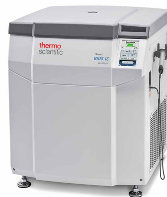
Sorvall BIOS 16 Bioprocessing Centrifuge