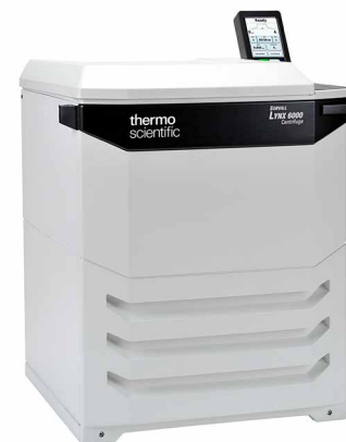
Sorvall LYNX 6000 Superspeed Centrifuge

The Sorvall LYNX 4000 and 6000 Superspeed Centrifuges, Sorvall BP 8 and 16 Blood Banking Centrifuges, Sorvall BIOS 16 Bioprocessing Centrifuge, Cryofuge 8 and 16 Large Capacity Blood Banking Centrifuges, and Sorvall/Hera-Series general purpose centrifuges represent a wide array of centrifuges and their innovative rotors. Covering a broad range of processing needs, these products support labware from microplates and microtubes to large-capacity bottles, and they are designed to deliver outstanding performance, spin after spin.