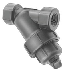
Y-strainer (1/2" NPT)

If your plant treats water that has particles larger than 130 micron, you will need to make simple adjustments to the TRO analyzer using accessory parts for optimal performance. This can be done by installing the 130 nm pore size Y-strainer, which is provided, prior to analyzer inlet. The sample inlet and sample return overflow fittings on the bottom of analyzer require 1/4-inch OD (6 mm OD) flexible tubing. Then, connect the inlet sample Y-strainer to the 1/4-inch tube through an adaptor, which is also provided. Next, connect the inlet sample Y-strainer with a 1/2-inch NPT pipe thread. Finally, the waste drain fitting at the bottom of the analyzer needs to be adjusted. This requires 3/8-inch OD (9.6 mm OD) flexible tubing.