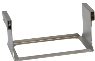
Savant UPC-1 Carrier