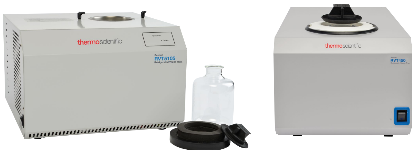
Savant RVT5105 Refrigerated Vapor Trap, Glass Condensation Flask and Flask Cap, disassembled