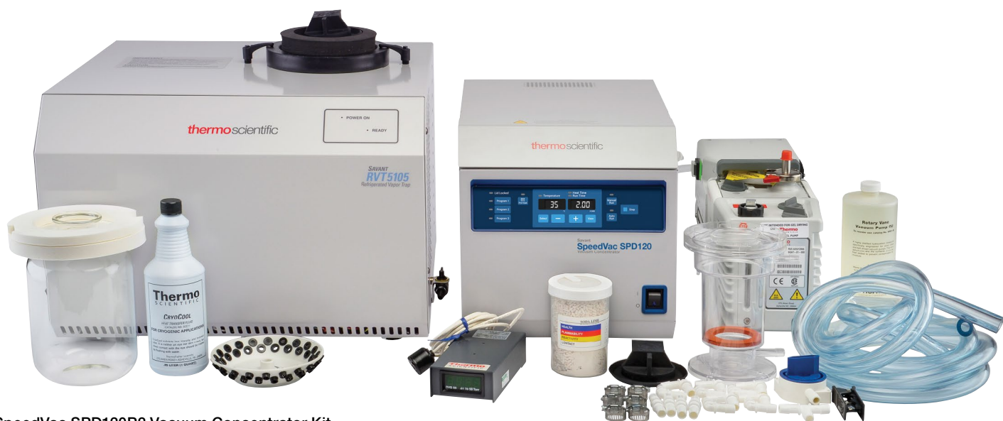
SpeedVac SPD120P2 Vacuum Concentrator Kit