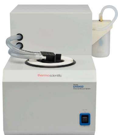
Savant UVS450 Universal Vacuum System