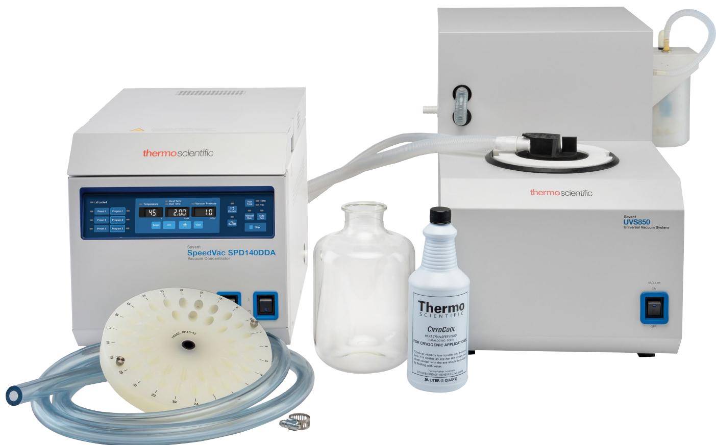
SpeedVac SPD140P2 Vacuum Concentrator Kit