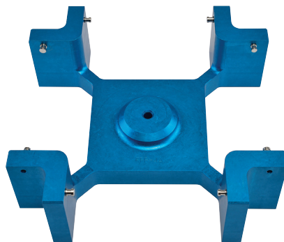
Savant FPR-4A Universal Plate