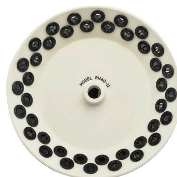
Savant RH40-11 Medium Capacity Rotor