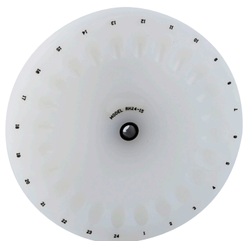
Savant RH24-15 Medium Capacity Rotor

† Can be used to upgrade to a Savant SpeedVac PRO Rotor Kit