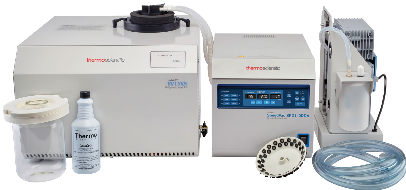
SpeedVac SPD140P1 Vacuum Concentrator Kit