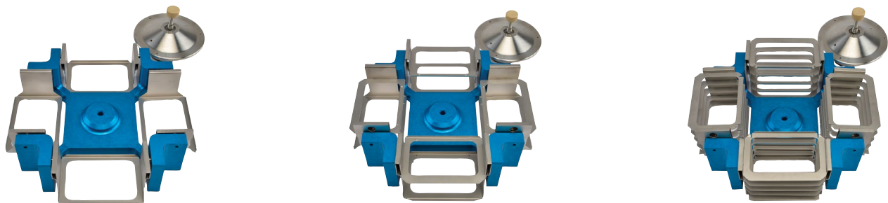
In order, from left to right: Thermo Scientific PRO-10, PRO-20, and PRO-50 PRO-rotor upgrade kits