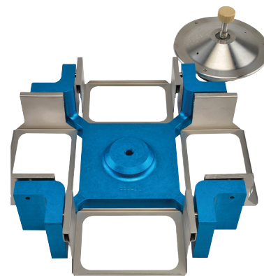
Savant PRO-10 Rotor Kit