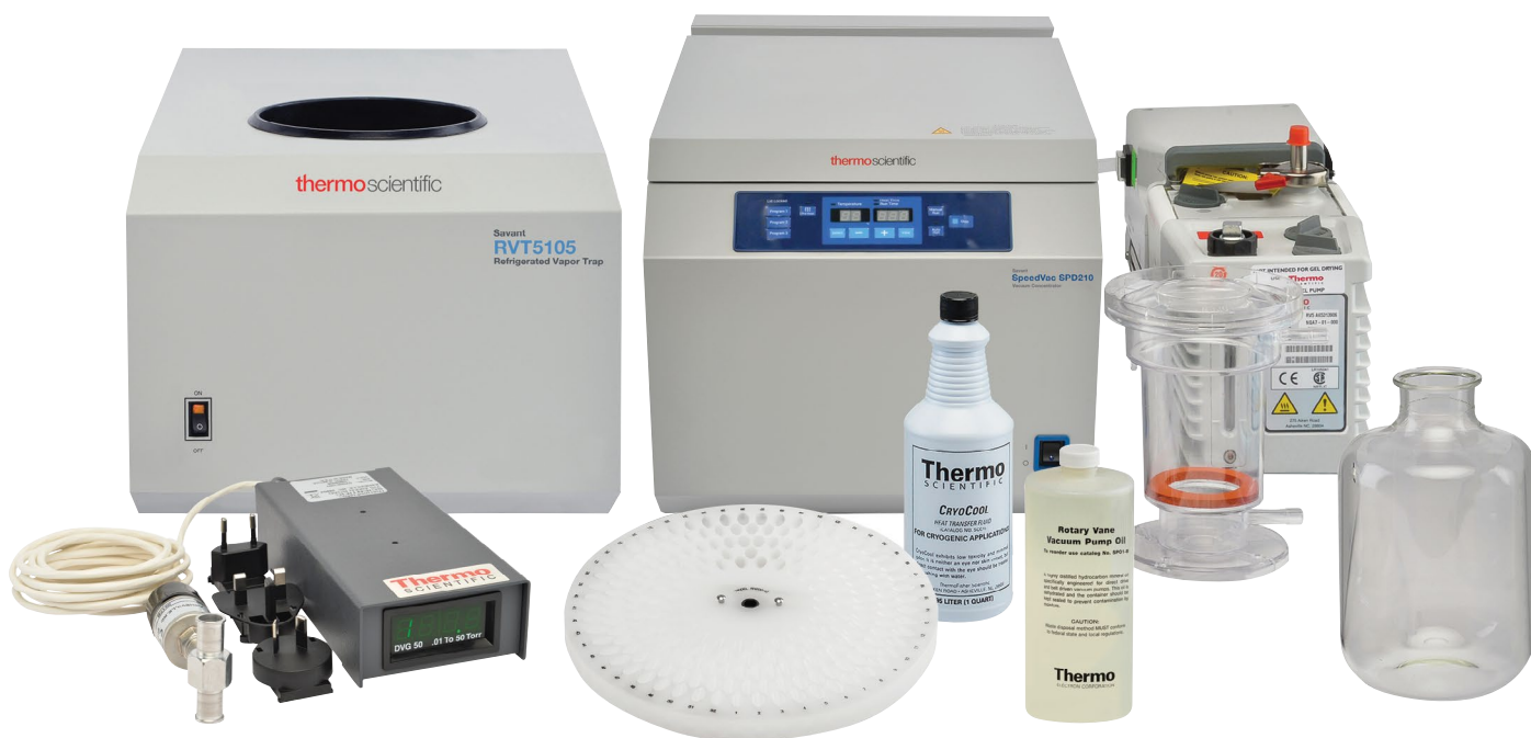
SpeedVac SPD210P1 Vacuum Concentrator Kit