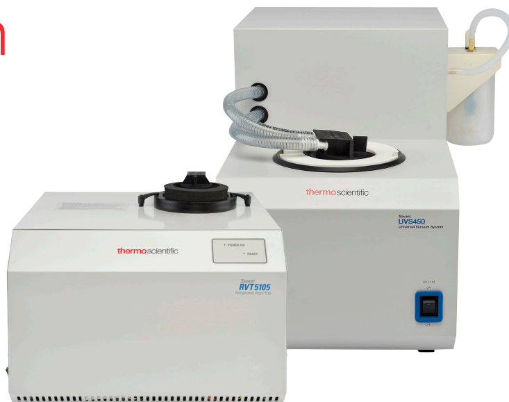
Savant Refrigerated Vacuum Trap RVT5105 (front) and Savant Universal Vacuum System UVS450 (rear)