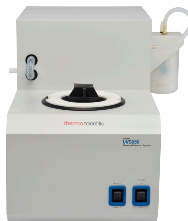
Savant UVS850DDA Universal Vacuum System