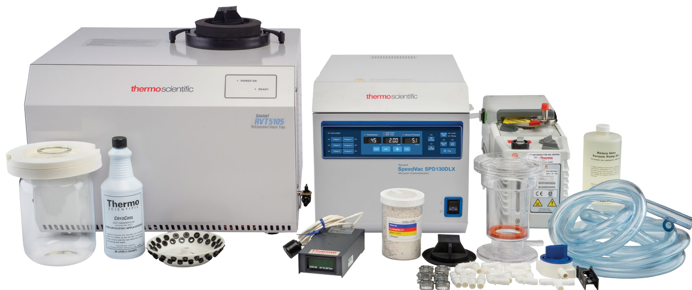
SpeedVac SPD130P1 Vacuum Concentrator Kit