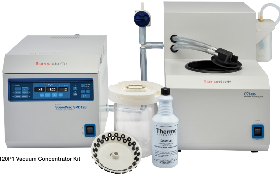
SpeedVac SPD120P1 Vacuum Concentrator Kit