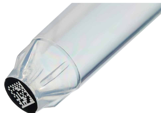
Figure 1. Matrix ScrewTop Tube showing the bottom of the tube with a three-layer laser-etched 2D barcode.

The readability of the 2D barcodes contributes to sample credibility; unreadable samples cannot be verified and lose traceability. Matrix ScrewTop Tubes are imprinted with 2D barcodes using laser-etching technology (Figure 1). To test the robustness of barcodes, we designed a study to examine the traceability of the 2D barcode. Matrix ScrewTop Tubes and tubes from four other suppliers were tested before and after multiple cryogenic freezing and thawing cycles, which were used to induce stress on the barcodes.