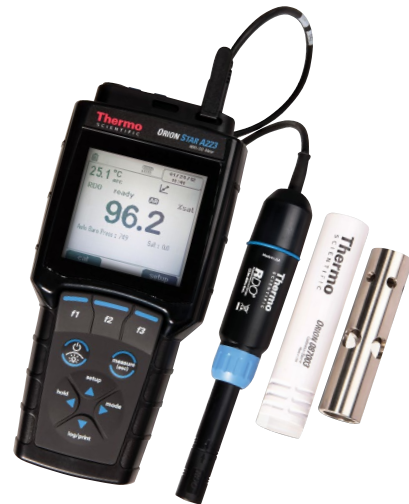
Thermo Scientific™ Orion Star™ A223 Dissolved Oxygen Portable Meter Kit