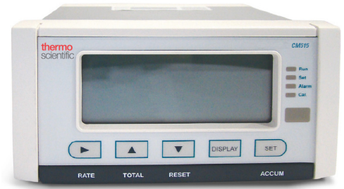
Thermo Scientific™ Sarasota CM515 panel-mounted density converter.

The Sarasota liquid density meters can provide output variables such as specific gravity, % concentration, °Brix, °API, °Baume, line density or referred density, when used in conjunction with a Sarasota density converter. The Thermo Scientific™ Sarasota HME900 integral, field-mounted density converter option provides a direct HART-compatible 4-20 mA output, whereas the Thermo Scientific™ Sarasota CM515 remote, panel-mounted computer provides a local display and a variety of operator selectable outputs that feed into a plant's optimization system.