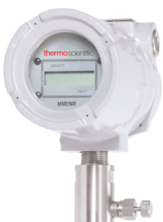
Thermo Scientific™ Sarasota HME field-mounted density converter.