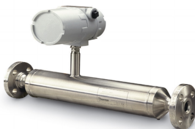
Thermo Scientific™ Sarasota FD910 and Sarasota FD950 Liquid Density Meters

These devices utilize the proven vibrating element design which is widely accepted as the most accurate method of continuous, online density measurement. In fact, our twin tube design is inherently more stable than single tube technology, and an integral, high grade PT100 temperature element within the instrument allows compensation of the density meter for temperature effect and may be used for compensation to reference conditions. Our meters detect any variation of process constituents or final product quality in near real-time to improve productivity, minimize product waste and reduce costs when compared to sampling methods.