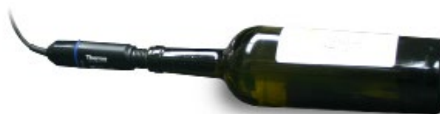
Thermo Scientific™ Orion™ Optical DO Sensor