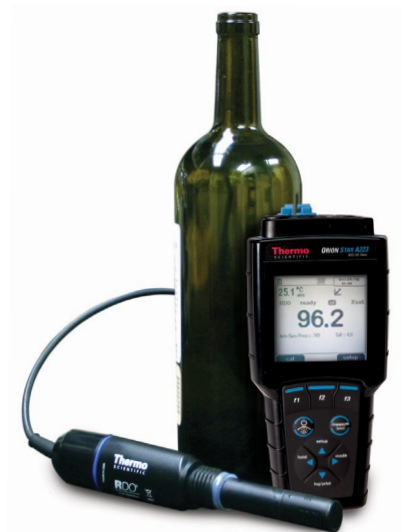
Thermo Scientific™ Orion Star™ A223 Dissolved Oxygen Portable Meter Kit

To purchase an Orion Star A223 DO Portable Meter, Orion Optical DO Sensor and other related products, please contact your local equipment distributor and reference the part numbers listed below.