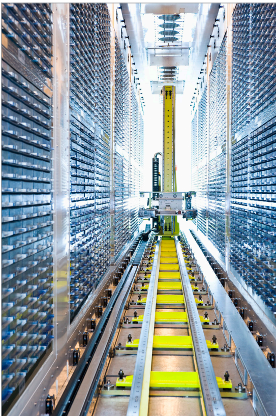
UK Biobank is being developed as a global research resource.

The scale, harmonization, and standardization of phenotype and genotype that we will see in large biobanks will almost certainly pay dividends even for traits where we already have studies involving several hundreds of thousands of people. The combination of harmonized genotyping and phenotyping, and the availability