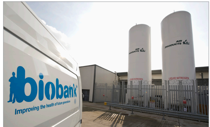
Large biobanks are combining vast numbers of samples with detailed phenotyping data.

isolate samples. It also requires us to expand our ability to detect different types of allelic variation across a broader frequency spectrum. We will want to look at somatic, as well as germline, variation. This is all about identifying as many of these human genetic "accidents of nature" as possible. Each allele that we find and link to a disease phenotype has potential to improve our understanding of disease mechanisms.