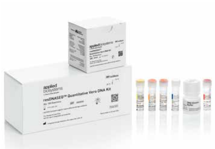
Table 1. DNA recovery using the manual protocol for the Applied Biosystems™ PrepSEQ™ Residual DNA Sample Preparation Kit. Assay performance data were determined using 10 pg Vero genomic DNA spike per sample, 2 matrices, and 27 test samples.

The Applied Biosystems™ resDNASEQ™ Vero Residual DNA Quantitation System is a quantitative PCR (qPCR)–based system for the detection of host cell DNA from Vero cells (African green monkey), an expression system commonly used for the production of vaccines. Reliable and rapid, the system enables sensitive (limit of quantitation = 1.5 pg DNA per mL of test sample, Figure 1) and specific quantitation of Vero cell DNA, typically in less than 4 hours. This performance helps ensure a high degree of confidence in quantitation data obtained from a broad range of sample types—from in-process samples to final product—whether the sample contains high molecular weight or sheared DNA (Figure 2).