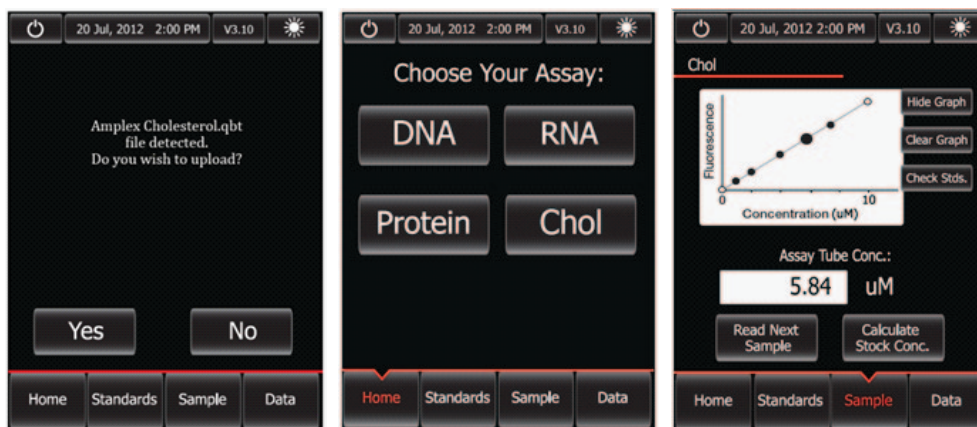
Figure 2 Upload of the MyQubit Amplex® Red Cholesterol assay. The Qubit® 2.0 Fluorometer will recognize the Amplex Cholesterol.qbt file and guide you through the upload process.