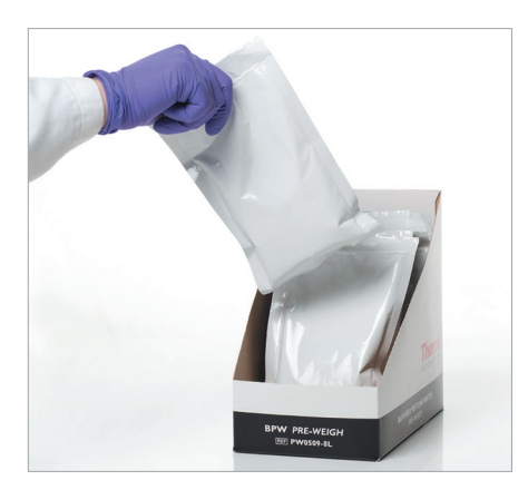
Pre-Weigh DCMs: supplied in shelf-ready boxes

Combine 1L and 8L Pre-Weigh pouches to fit your culture media batch sizes—suitable for use with and without media preparators