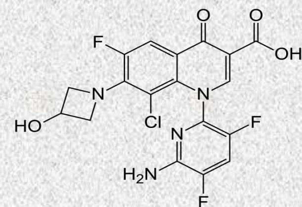
Figure 1. Chemical Structure of Delafloxacin