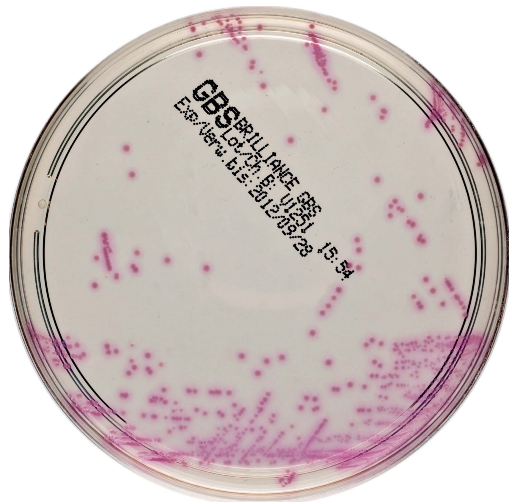
FIGURE 1. Growth of GBS on Brilliance GBS Agar