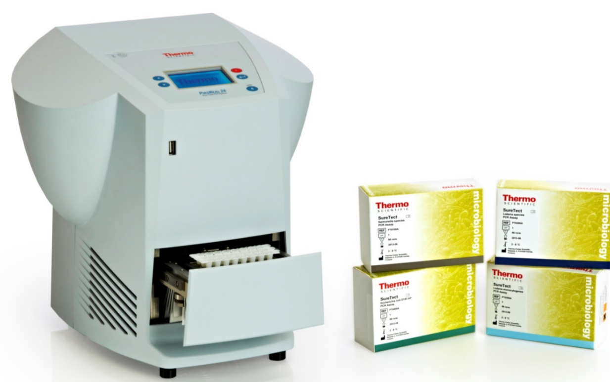
FIGURE 1. The Thermo Scientific SureTect System.

The Thermo Scientific SureTect Salmonella species Assay (PT0100A) is a new Real-Time PCR test for the detection of Salmonella from food, animal feeds and environmental samples, which combines pre-dispensed lysis reagent and lyophilised, tableted PCR reagents to simplify and improve assay handling, along with dedicated software to run the assays as well as interpret and display PCR results. This study was conducted using the AOAC RI Performance Tested Methods SM program 1 to validate the SureTect Salmonella species assay in comparison to the reference method detailed in ISO 6579:2002 2 with a variety of food matrices.