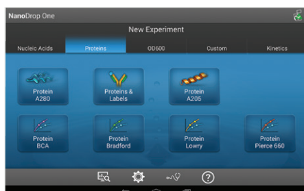
Figure 1. NanoDrop One Proteins Home screen showing available preprogrammed applications for protein quantitation.