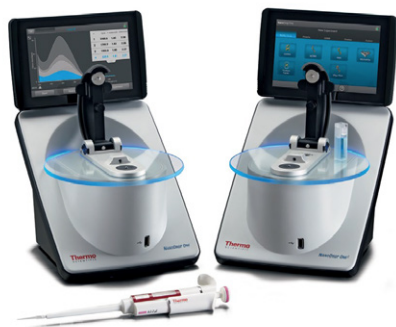
Thermo Scientific NanoDrop One/One C Microvolume UV-Vis Spectrophotometer