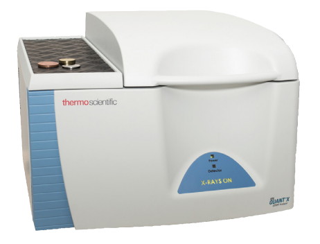
Figure 2:. ARL QUANT'X EDXRF instrument

The Thermo Scientific<sup>™</sup> ARL<sup>™</sup> QUANT'X Energy-Dispersive XRF Spectrometer uses a highly sensitive silicon drift detector (SDD) to discriminate between the energy of the incoming radiation and therefore is able to measure all elements between Na (Z = 11) and U (Z = 92). It is equipped with a 50 W Rh or Ag tube which can be operated at voltages up to 50 kV. Conversion of spectra into elemental/ oxide concentrations is achieved with the Fundamental Parameters (FP) based UniQuant standard-less package. The rugged and compact design as well as low demand on peripheral support make the ARL<sup>™</sup> QUANT'X a perfect solution for industrial environments.