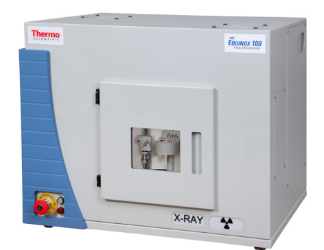
Figure 1: ARL EQUINOX 100 diffraction system

The ARL EQUINOX 100 (c.f. Figure 1) provides very fast data collection compared to other diffractometers due to its unique curved position sensitive detector (CPS) that measures all diffraction peaks simultaneously and in real time.