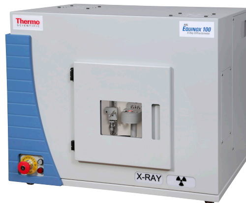
Figure 1: ARL EQUINOX 100 X-ray Diffractometer

One of the most commonly used method to asses the microstructure of metal alloys is X-ray diffraction (XRD) where it's possible to directly measure crystallographic structures of related components and quantify their content. This is especially helpful to plan temperature treatment steps, analyze the anisotropy of the printing process or gain indications of the mechanical properties of the parts. By choosing the type of radiation (e.g. Co or Mo radiation) it's even possible to vary the penetration depth and therefore the volume of the analysis.