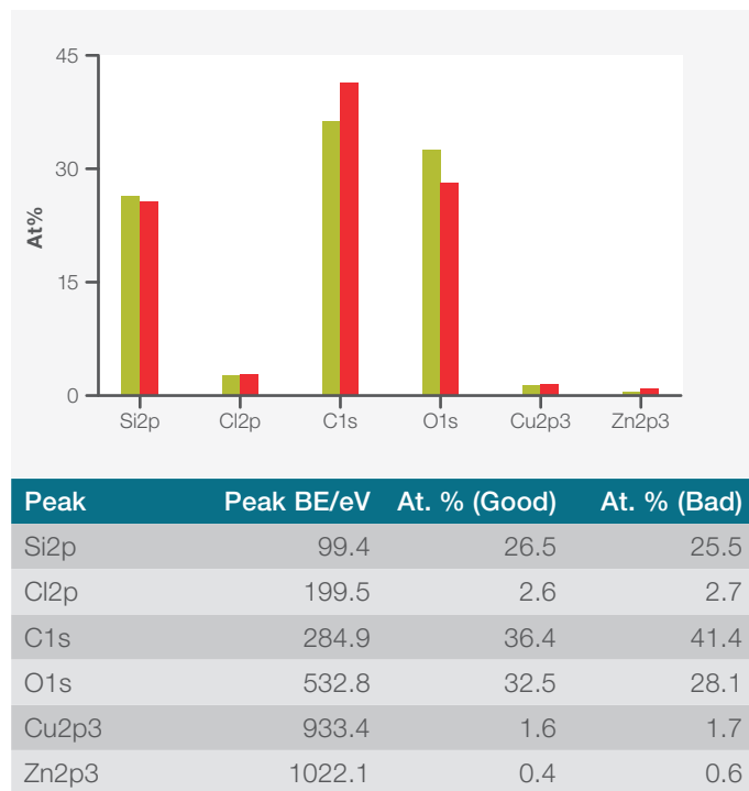
Figure 1: Elemental composition of the “good” and “bad” samples based upon analysis of the survey spectra.

Both samples had similar elemental compositions, as shown in Figure 1, with the main differences being changes in the carbon and oxygen concentrations. This could be significant, but at these levels, it is more likely to be due to small changes in surface contamination.