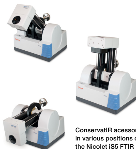
ConservatIR accessory in various positions of the Nicolet iS5 FTIR sample compartment.