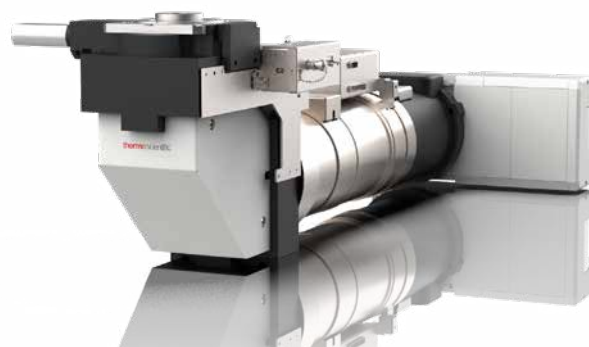
The Thermo Scientific Selectris Imaging Filter.

Compatibility: Selectris and Selectris X Filters are available on new Krios and Glacios Cryo-TEMs. Retrofits to existing microscopes are possible on most Thermo Scientific cryo-TEMs operating under Windows 10.