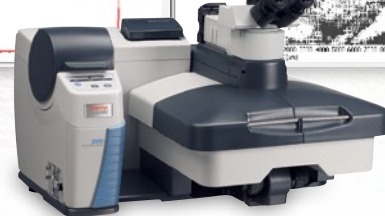
Thermo Scientific DXR3 Raman Microscope