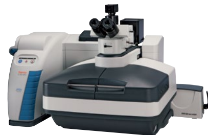
Thermo Scientific DXR3xi Raman Imaging Microscope