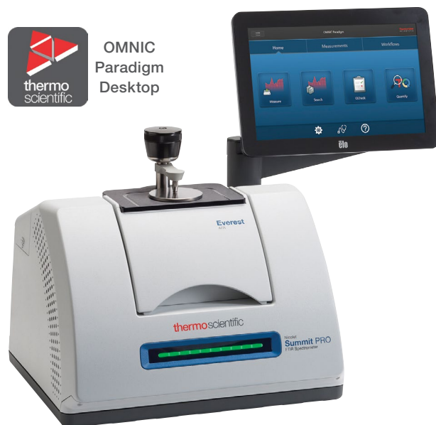
Thermo Scientific Nicolet Summit FTIR Spectrometer