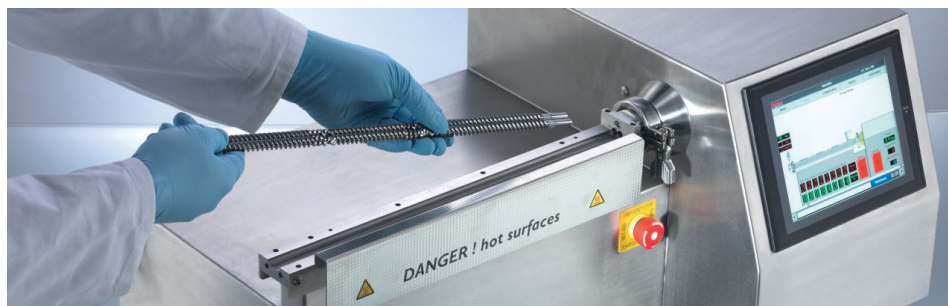
Easy cleaning due to clam-shell barrel design with removable top-half barrel.

Find out more at thermofisher.com/process11