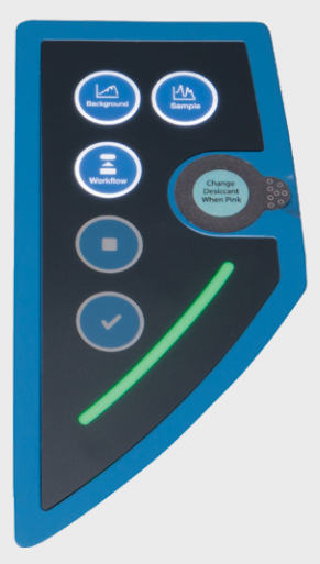
Ready for analysis

A solid-pulsing, green light lets you know your instrument is ready to run.